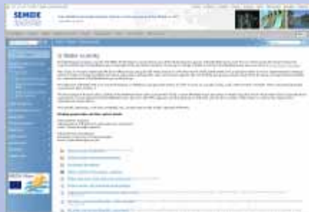
Monthly eNews Flash in Arabic, English and French