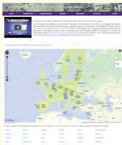
Figure 59: Cover page of the UWWTD SIIF European node

The SIIF project opted to implement an open-source IT toolbox. The tool was designed to disseminate environmental data and information at national level but also to facilitate the reporting process. It provides EU Member States with a cheap way to implement Article 11 of the INSPIRE directive, and thus to develop a national waste water website. The framework of this website can also be adapted to correspond to other European Policies.