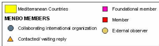
REMOC / MENBO / REMOB Current state of recruitment members OCTOBER 2008